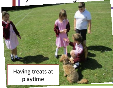
Having treats at playtime

Approach me calmly from the front Stroke my back with one hand only Make sure I never have more than three hands on me If I move away, leave me be Only feed me dog treats that an adult has given you