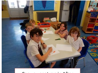
Can you spot me in After School Club?

One of my favourite parts of the day is After School Club. I get to join in with the activities, go for walks in the playground and get lots of strokes and attention.