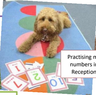
Practising my numbers in Reception