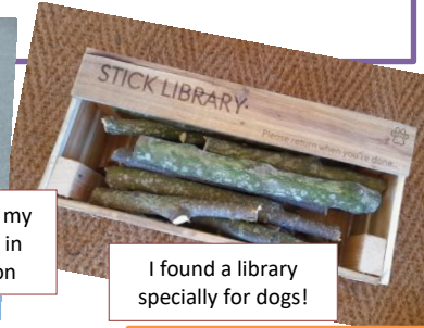
I found a library specially for dogs!