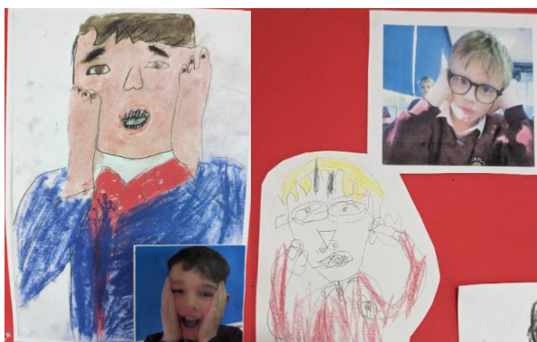
A couple of our self-portraits

In English, we have been using fronted adverbials in our work, to give more detail about how, when or where something happened.