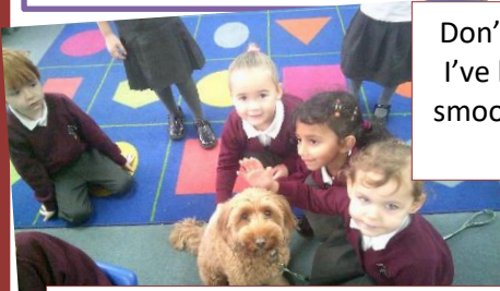
A visit to Chestnut Class – I loved the special tack the children made me!