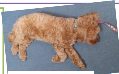
The first week back has been very tiring – time for a nap!

Everyone always seems to be having so much fun during their swimming lessons, especially when the sun is out like it has been this week. I'm not allowed in the pool, so have to make do with watching the children instead.