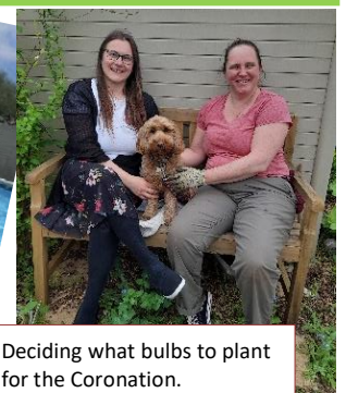
Deciding what bulbs to plant for the Coronation.